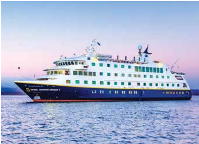
NATIONAL GEOGRAPHIC ENDEAVOUR II 96 Guests | 52 Cabins

Our exceptional ships are perfectly adapted for the unique geography they explore—ranging in size from yacht-like to authentic expedition ships, accommodating 28-148 guests.