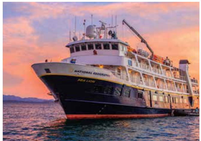
NATIONAL GEOGRAPHIC SEA LION 62 Guests | 31 Cabins