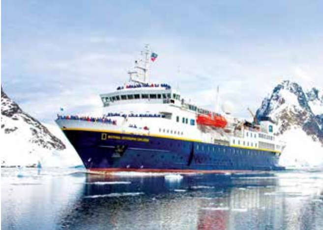
NATIONAL GEOGRAPHIC EXPLORER 148 Guests | 81 Cabins