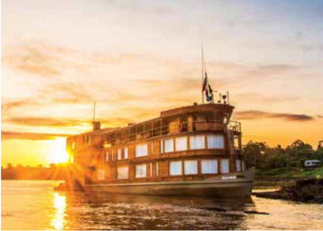
DELFIN II 28 Guests | 14 Cabins