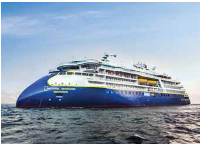
NATIONAL GEOGRAPHIC ENDURANCE 126 Guests | 69 Cabins