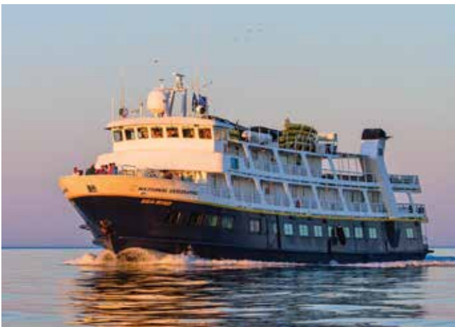
NATIONAL GEOGRAPHIC SEA BIRD 62 Guests | 31 Cabins