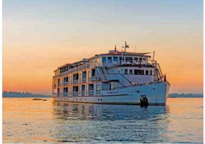
THE JAHAN 48 Guests | 24 Cabins