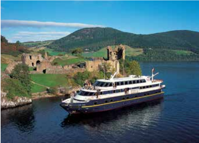
LORD OF THE GLENS 48 Guests | 25 Cabins