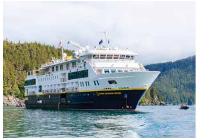
NATIONAL GEOGRAPHIC VENTURE 100 Guests | 50 Cabins