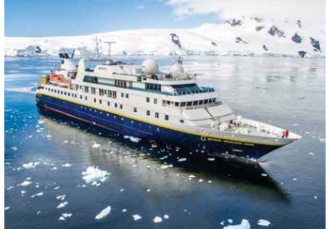
NATIONAL GEOGRAPHIC ORION 102 Guests | 53 Cabins