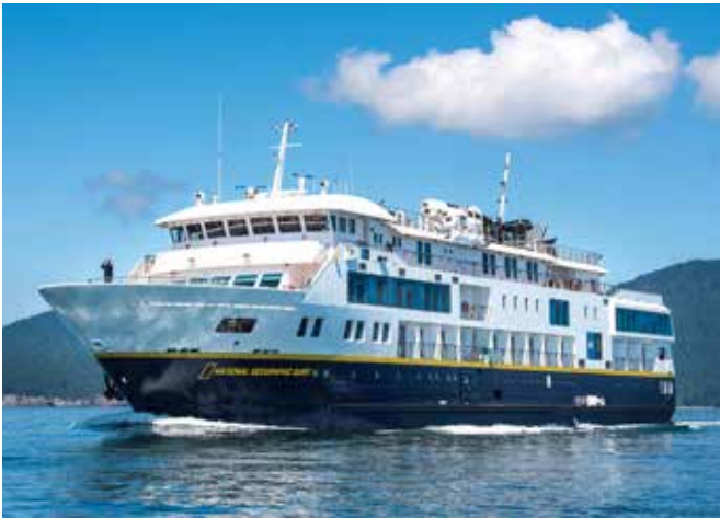
NATIONAL GEOGRAPHIC QUEST 100 Guests | 50 Cabins