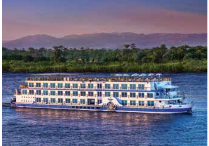
OBEROI PHILAE 42 Guests | 22 Cabins