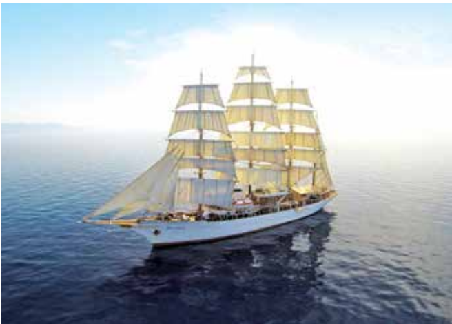
SEA CLOUD 58 Guests | 30 Cabins