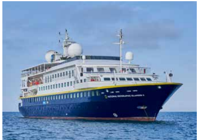
NATIONAL GEOGRAPHIC ISLANDER II 48 Guests | 26 Cabins