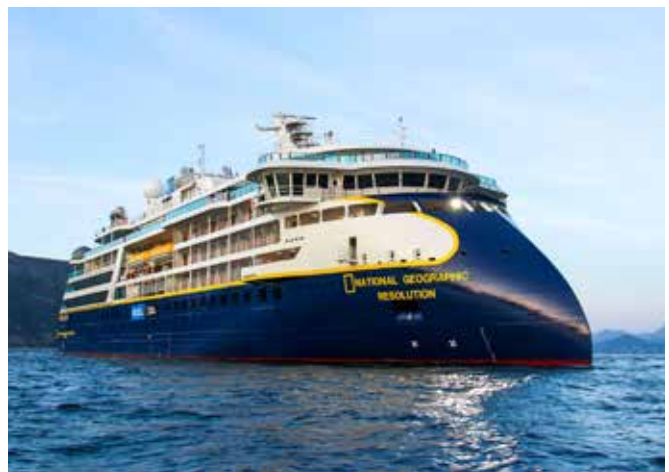
NATIONAL GEOGRAPHIC RESOLUTION 126 Guests | 69 Suites